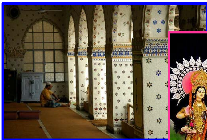
The Star Mosque*

The religions practiced in Bangladesh include Islam, Hindu, Christianity, Buddhism and tribal religions. Islam, recognized as the state religion in June of 1988, is followed by 89.5% of the population. Most Muslims are Sunnis; however, there is a small community of Shia Muslims in Bangladesh. Followers of the Hindu religion comprise 9.6% of the population, while the remaining 0.9 % is comprised of Buddhists, Christians and followers of various tribal religions.