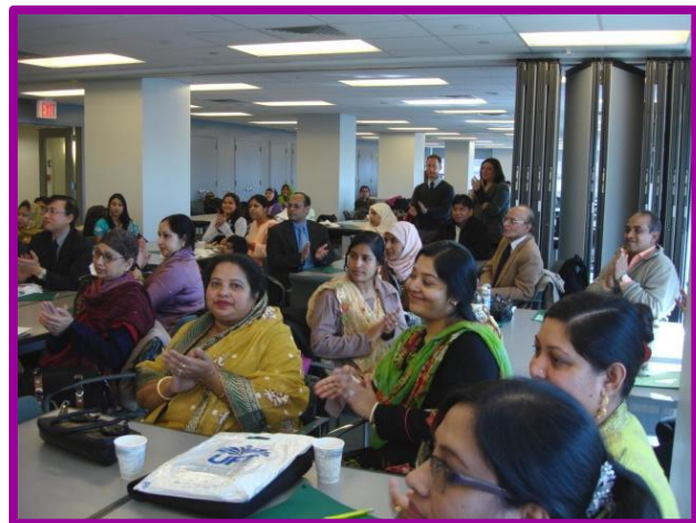
Bengali Parent Conference

The subject areas of Mathematics, Living Environment and Global History are taught in English with native language support. Teachers utilize the English-Bengali subject area glossaries, as well as bilingual and native language dictionaries, to help students comprehend the new subject area material. After school tutoring programs in Global History and Living Environment provide additional support for students. In addition, The South Asian Club provides students with the opportunity to socialize with one another and learn together.