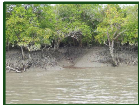
Mangrove Forest at Sundarbans National Park**

➤ The largest Mangrove Forest in the world is located in Bangladesh, at the confluence of the Ganges, Brahmaputra and Meghna Rivers. It is part of the Sundarbans National Park and home to the Royal Bengal Tiger. It has been designated a World Heritage site by UNESCO.