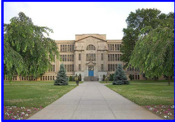
John Adams High School*

Over the past few years, a large number of Bengali immigrants have relocated to the Ozone Park area of Queens due to changes in the economic environment and property value factors. To respond to the needs of this new community, John Adams High School has established a Bengali bilingual program, staffed by four dedicated Bengali bilingual teachers, to educate these youngsters who have relocated with their families. One hundred fifty (150) students are currently enrolled in the bilingual program.