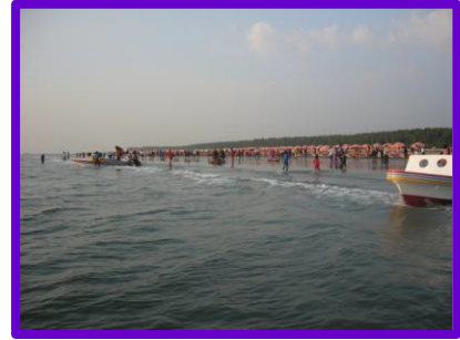
Cox's Bazaar Beach*

➤ The longest uninterrupted natural beach in the world, Cox's Bazaar, is located on the Bay of Bengal in Bangladesh. It is 120 kilometers in length and 152 kilometers south of the city of Chittagong.